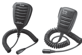
HM-167 HM-202 IPX8 rugged type IPX7 compact type