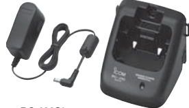
BC-123S* BC-210 Charges the BP-245H in 2.5 hours (approx.). * BC-123SA for 120V AC. SE for 230V AC.