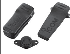
MB-86 MB-103 Swivel type Alligator type