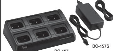
BC-197 BC-157S Charges up to six BP-245H in 2.5 hours (approx.). AD-129 is supplied with the BC-197, depending on version.