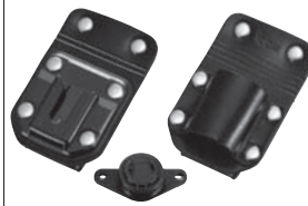
MB-96N MB-96F Swivel type Fixed type